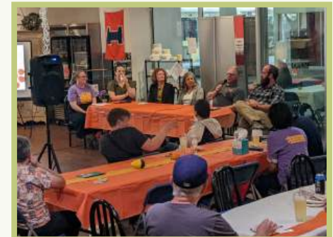
Annual Meeting of Owners at Cloud Mountain