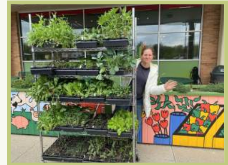
15th Annual Plant Sale Fundraiser