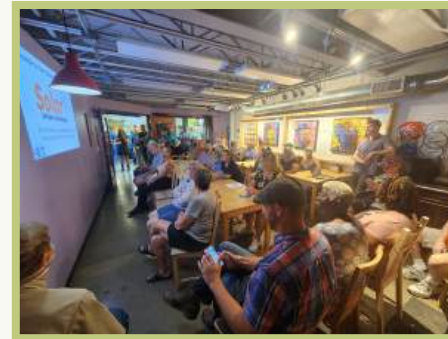
Solar Power Hour with Solar Urbana-Champaign