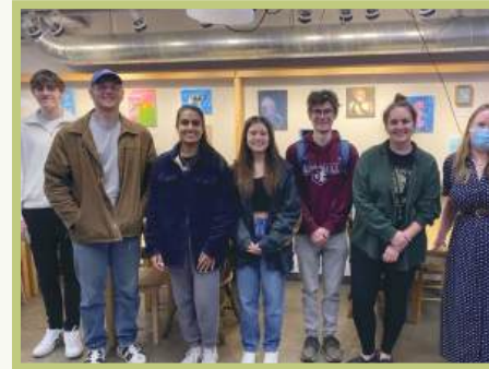
University of Illinois Student Group Tours